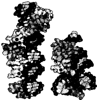
Figur 4: Zinc molecular structure. Zinc binding is mediated by two histadine and two aspartic acid residues mimic size and shape of a DNA molecule.

for its production of citrate as a component of normal semen. It also utilizes lot of energy and production of ATP. Normal prostate epithelial cells are high in Zinc content. But when a prostate cell becomes transformed to tumor cells it is low of Zinc and utilised all energy in tumor proliferation and progression. Zinc is transported through 24 zinc transporter protein. Some of which also acts as tumor suppression gene like Zip1, Zip2, Zip3 and these are also down regulated when there is tumor progression. Some mutation in mitochondrial DNA, immediate early gene Egr1 over expression, suppression of Metallothionein (MT) a major receptor/donor of Zinc in the cells are responsible for tumorigenesis in prostate cancer. Zinc supplement has improved and halted progression to tumorigenesis in some studies but not in other studies. So more elaborate scientific research should be carried out to conclude the exact role of Zinc in tumor specially Prostate cancer.