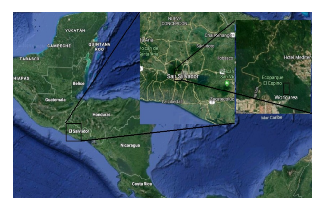
Figure 1: Region of study from Central America view. The study area of 'Ecoparque El espino' has a straight line of 189.1m \pm 0.5m , and the coordinates for the end points of our survey are presented in table 1.